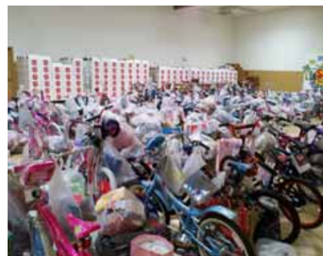
Gifts for the Salvation Army's Angel Tree giving program