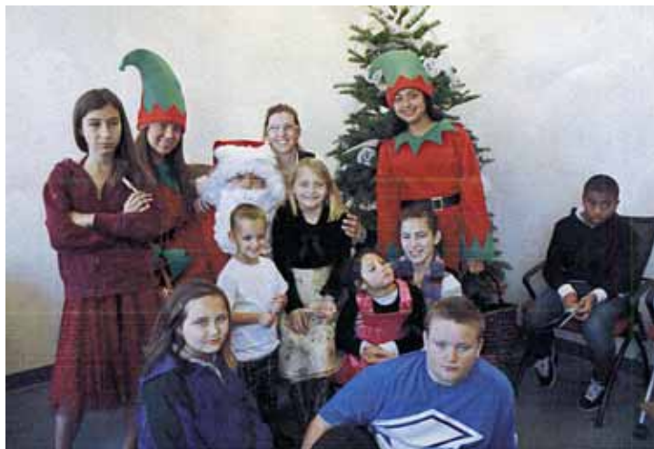
Some of the family referred by the San Joaquin County D.A.'s office who also were recipients of gifts from St. Basil parishioners, our first year participating in their program