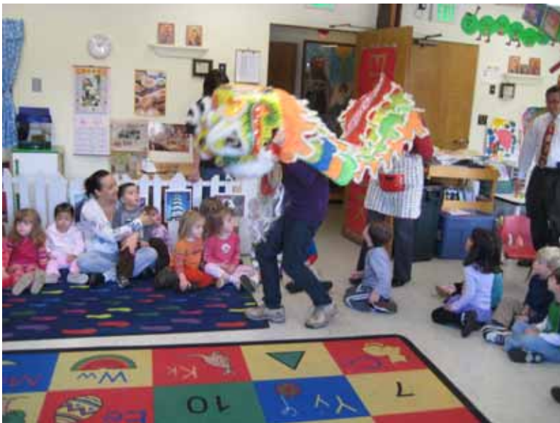
St. Basil Preschool children celebrating Chinese New Year - the Year of the Dragon