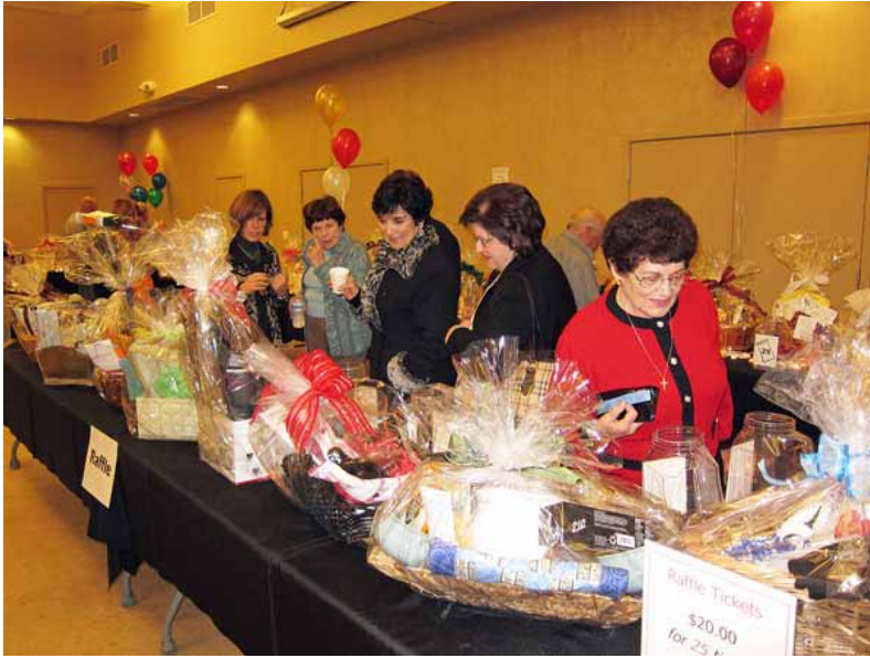
The ladies of Philoptochos, pre-crabfeed, inspecting the raffle baskets