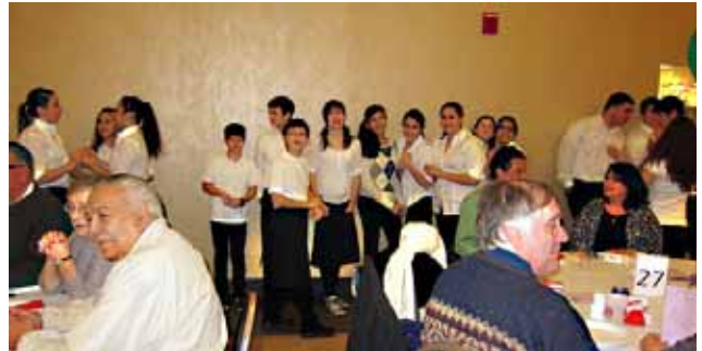
Some of our youth who expertly served at the event