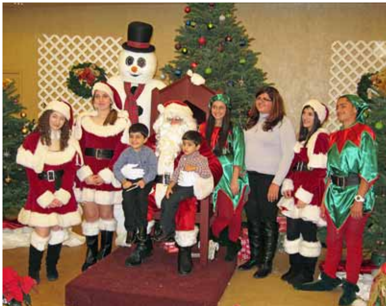
Santa, his helpers & children St. Basil Christmas Party / December 17, 2011