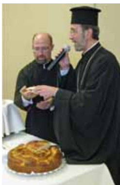
Distributing the Vasilopita