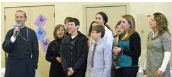
Youth & parishioners with His Eminence